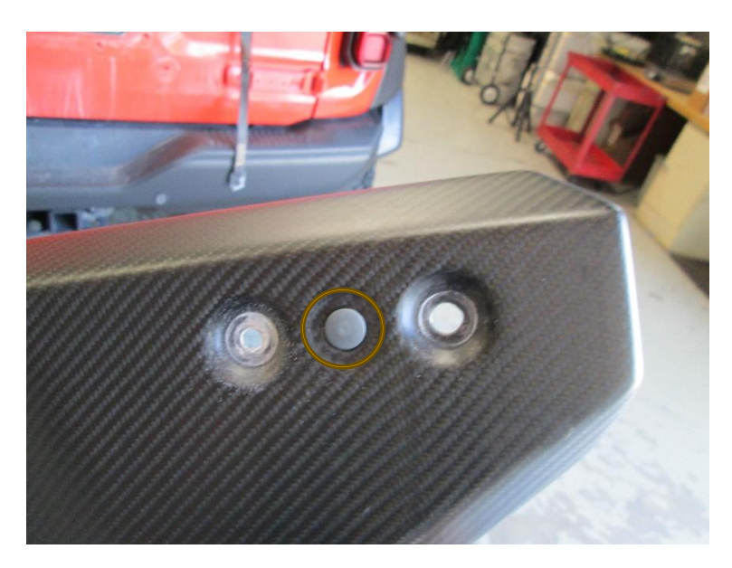
Step 7: To install the carbon fiber exoskeleton, reverse the removal procedure.

NOTE: Hand tighten the (4) bolts, do not use power tools to install. Excessive pressure may damage the carbon fiber.