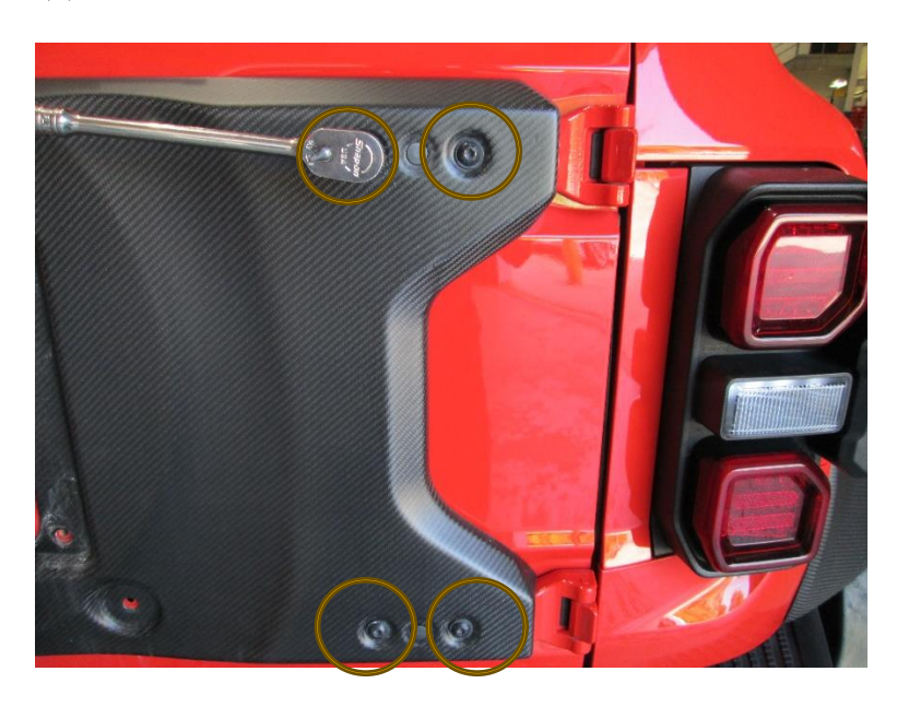
Step 6: Install the supplied accessory plugs into the carbon fiber exoskeleton.